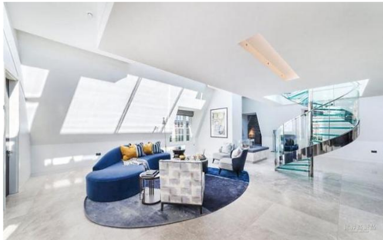
▲ Lease-based Mayfair House top loft, for the top of the pyramid tribes to provide pressureless LONG STAY will live music.

Keywords: Four Seasons (19) ■ Four Seasons Hotel (9) ■ Derek William (1) ■ Mayfair House (1) ■ W1 (1)